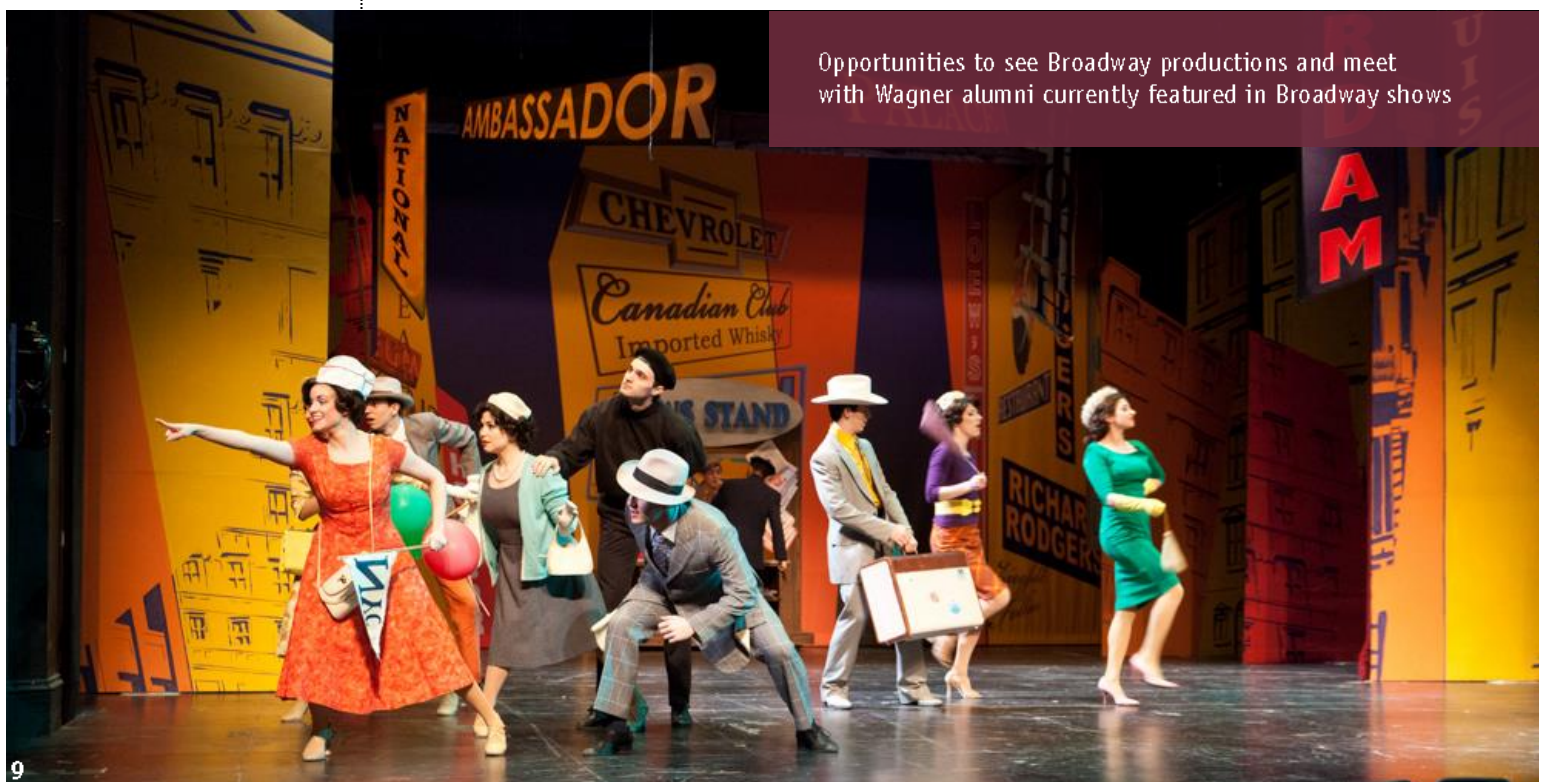
Opportunities to see Broadway productions and meet with Wagner alumni currently featured in Broadway shows