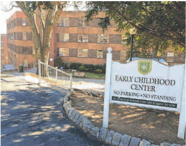
The Wagner College Early Childhood Center is located on two floors of Campus Hall, at the back of the Grymes Hill campus.