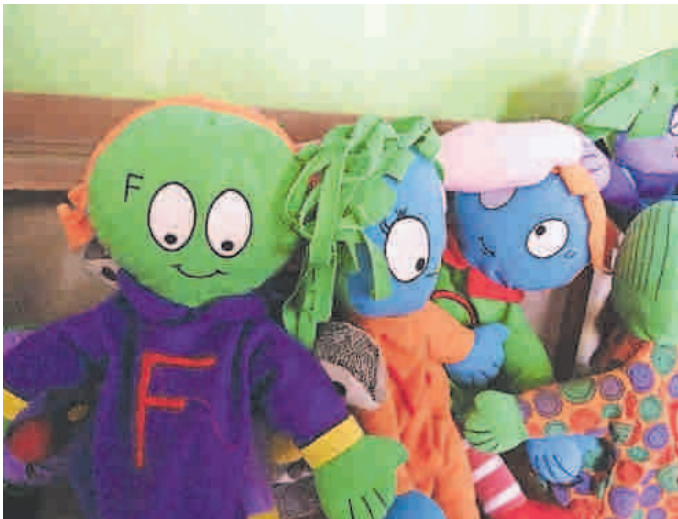
“Letter people” help preschoolers learn the alphabet.