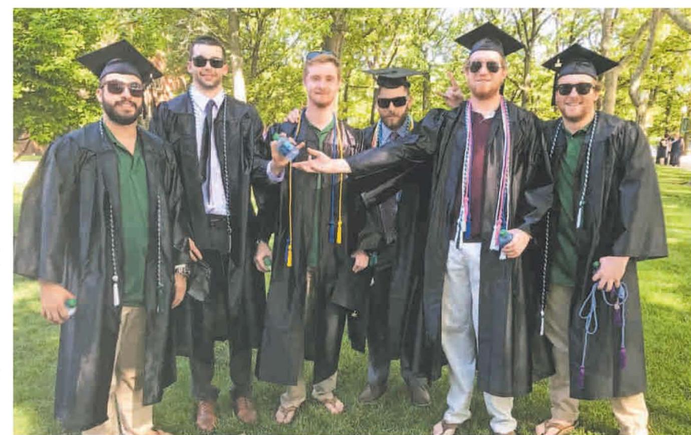
A group of friends poses for a photo after the ceremony.