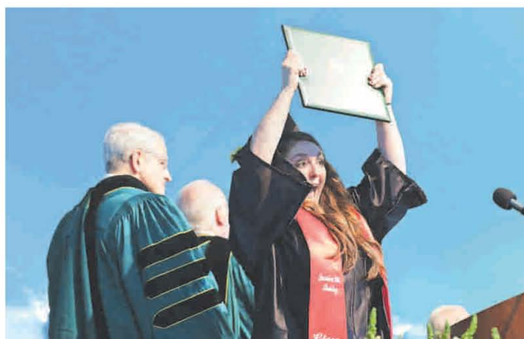
A graduate expresses her delight at receiving her awards.