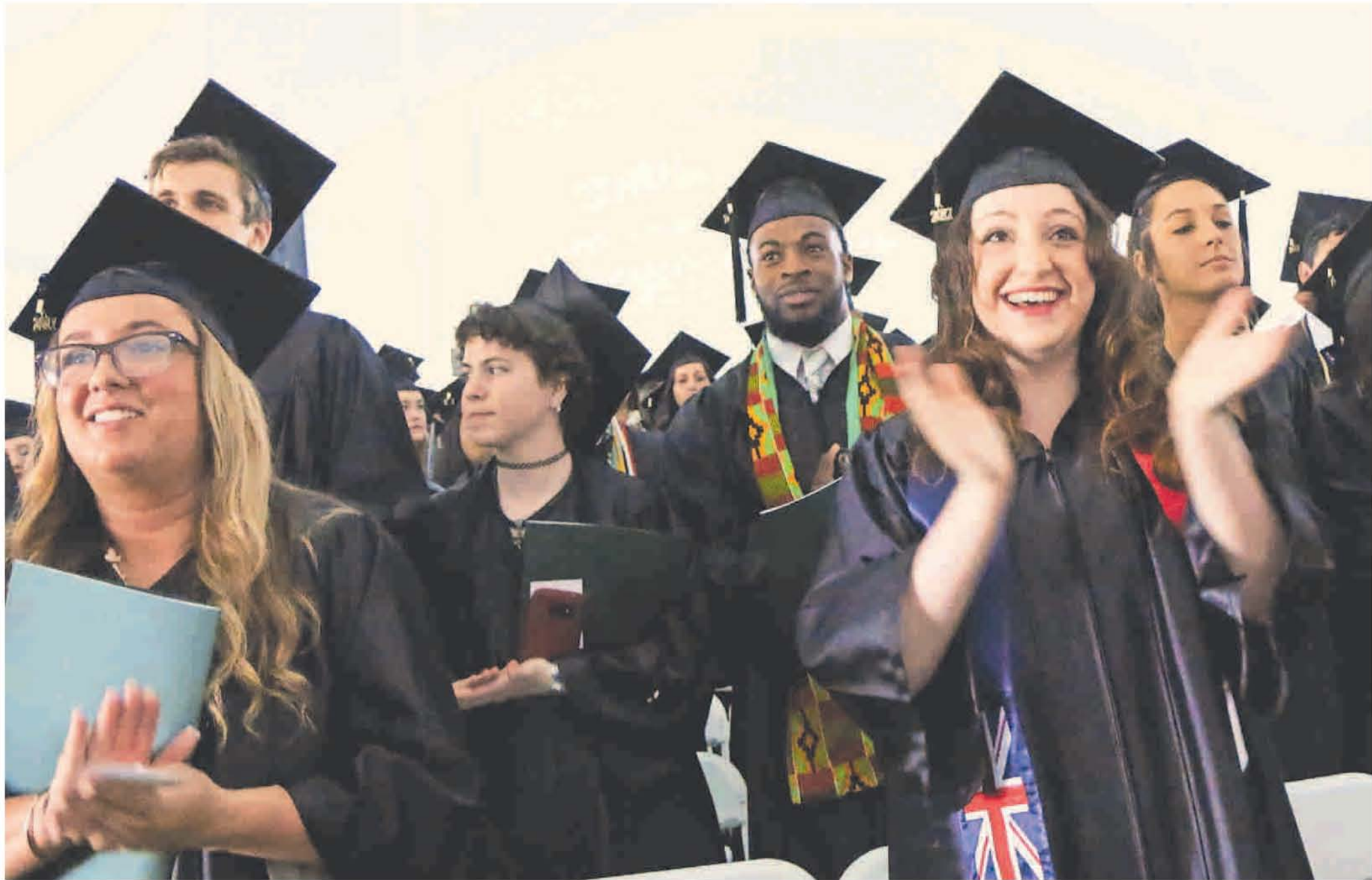
Graduates applaud during the 128th Wagner College commencement ceremony, held outdoors on the Grymes Hill campus on Friday.