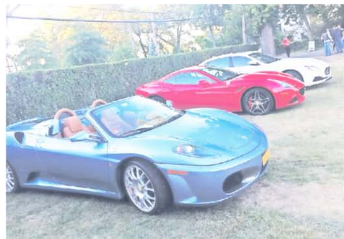
The Italian Cultural Foundation hosts its annual Festa D'Italia at Casa Belvedere on Saturday.

St. Ann's School welcomes comic book fans its annual Comic Con on Friday