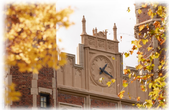
Main Hall Fall Leaves