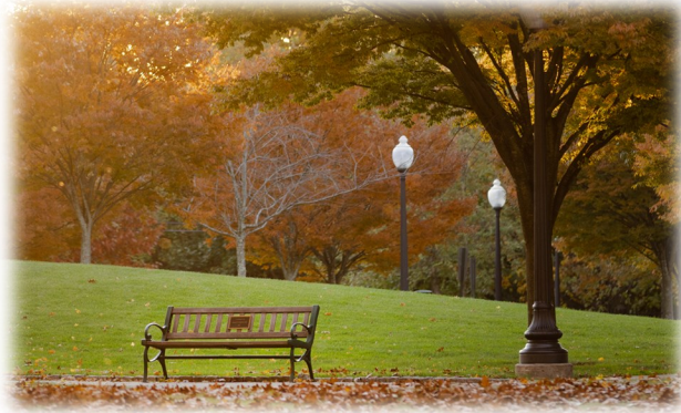
Trees Behind Pape House