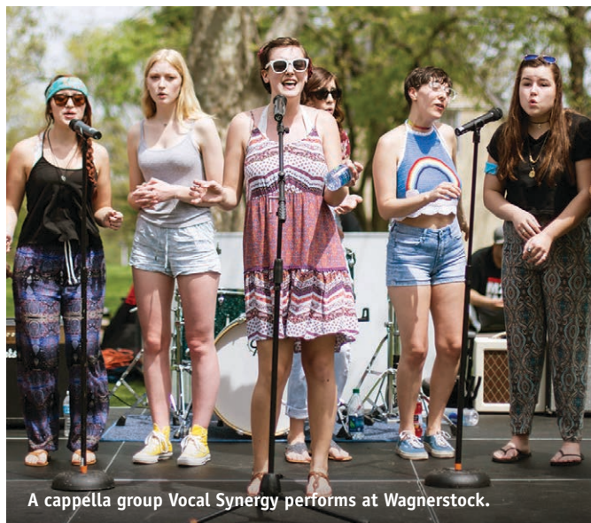
A cappella group Vocal Synergy performs at Wagnerstock.

The Oval is Wagner College's big, beautiful green lawn in front of Main Hall — the one you see in all of our pictures. As soon as the temperatures warm up and the sun is out, it's swarming with students hanging out. Songfest is a one-night show that pits Greek organizations and other student clubs against each other in a singing and dancing contest. "These groups practice and rehearse for weeks, and the show never disappoints," says the Wagnerian . Wagnerstock is an afternoon of music, food, and art outdoors on the Oval.