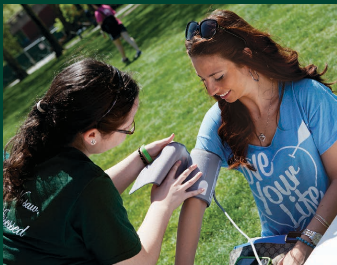
STUDENT NURSES ASSOCIATION