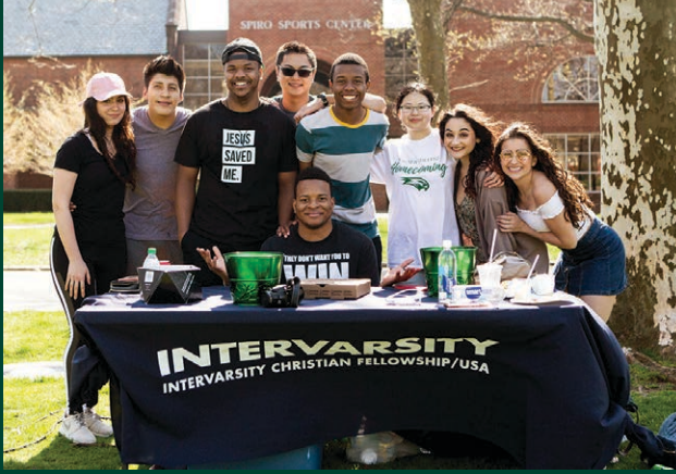
INTERVARSITY CHRISTIAN FELLOWSHIP