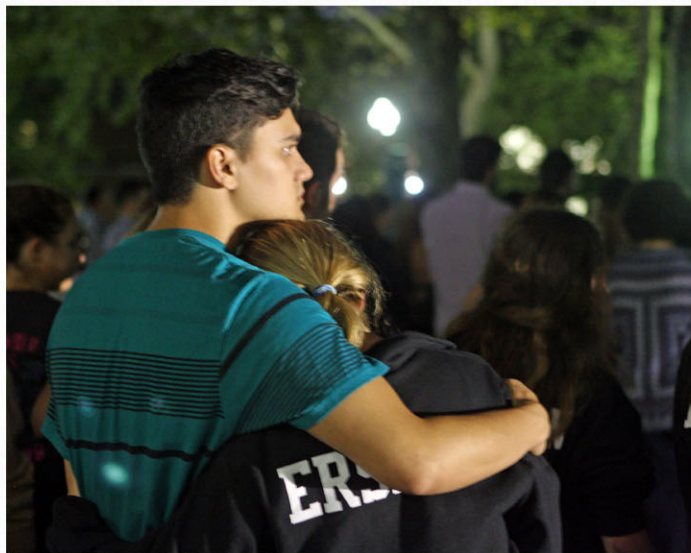
Wagner College students try to comfort one another as they mourn the passing of their school mate.